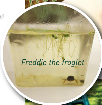
Freddie the froglet